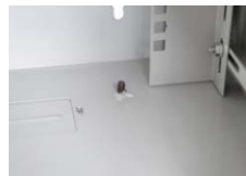
Earthing screw inside